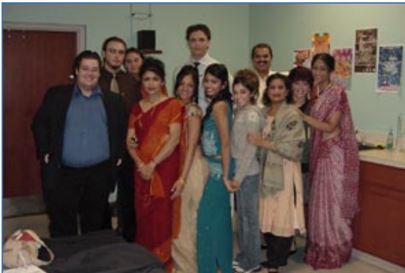
Cast members from Interrogations.

http://timesofindia.indiatimes.com/specialcoverage/168047.cms