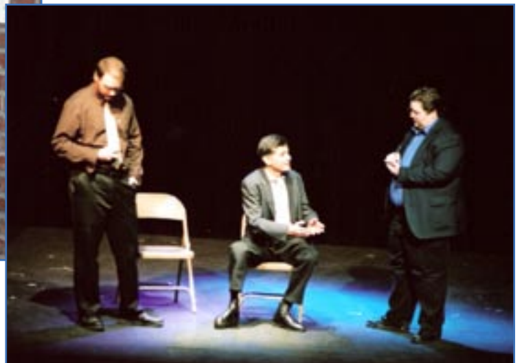
A scene from Interrogations .